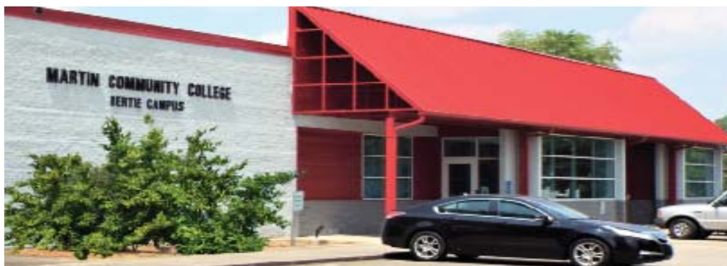
Windsor Campus, Bertie County