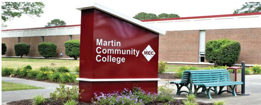
Williamston Campus, Martin County

In 2021 and 2022 the Orthopaedics program was added with renovated space in Building 3, the Emergency Medical Services (EMS) program was expanded with space renovations in Building 4, Cosmetology was expanded to include a Manicure Lab in Building 1, the Continuing Education Learning Lab was renovated and divided into spaces for the Human Resources Development (HRD) and College & Career Readiness (CCR), and partnerships with NCWorks Career Centers in Martin and Bertie Counties lead to housing these services on both Martin and Bertie campuses.