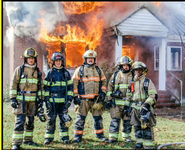
First Graduates of MCC's Fire Academy 2020

Martin Community College proudly serves these Fire Departments